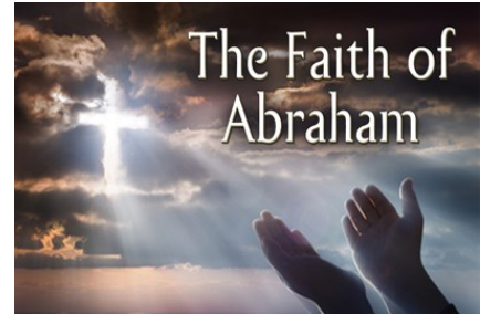
Faith will lead us to Christ